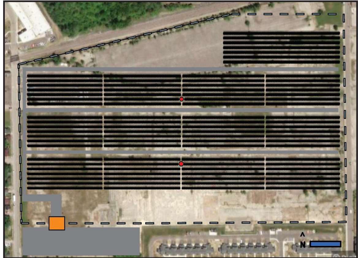
SunPower: SPR-400-WHT Two panels stacked vertically

The solar panels cover roughly 40 acres of the 58. The annual energy value of the 40 acres estimates to $2,854,165. With the size and annual energy value of the sites potential gain from the solar farm the 40 acres is a good amount of coverage. There is potential to cover more grounds which will increase the energy value by nearly $2,000,000 a year.